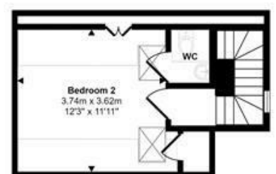
Second Floor Approx 23 sq m / 249 sq ft